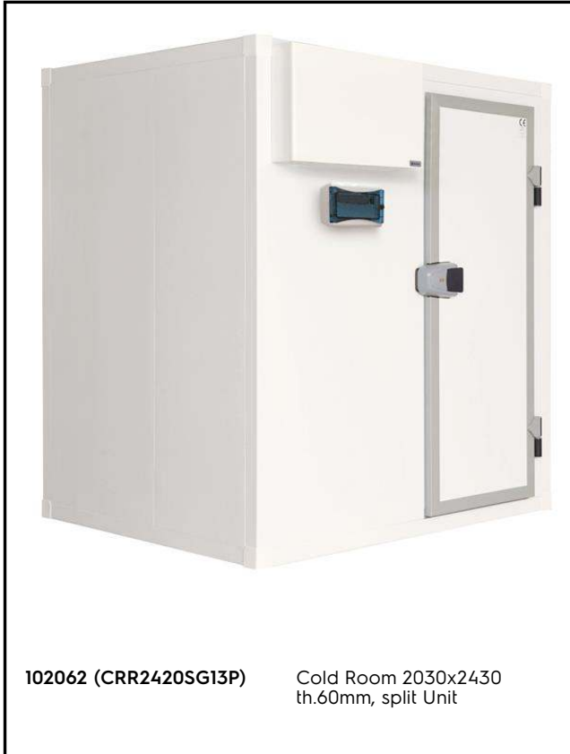
102062 (CRR2420SG13P) Cold Room 2030x2430 th.60mm, split Unit